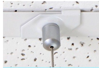
TWIST CEILING ANCHOR U.TCA.1/T