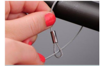
LOOP END CABLE (Lasso) CABLE.2/L