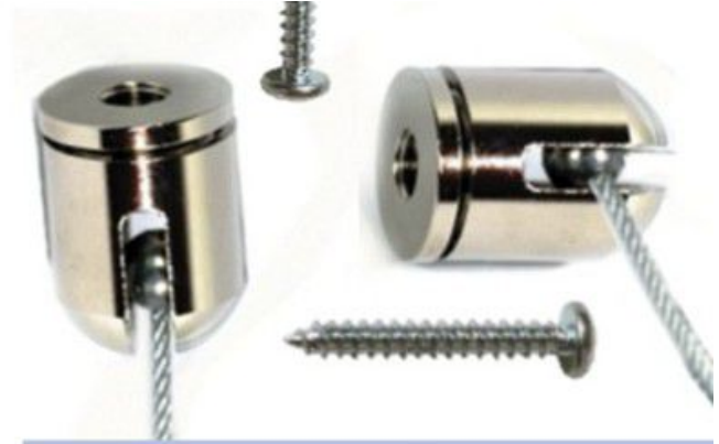
DOME SLOTTED ANCHOR