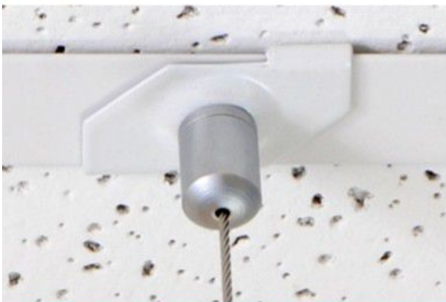
TWIST CEILING ANCHOR