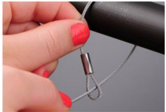
LOOP END CABLE (Lasso)