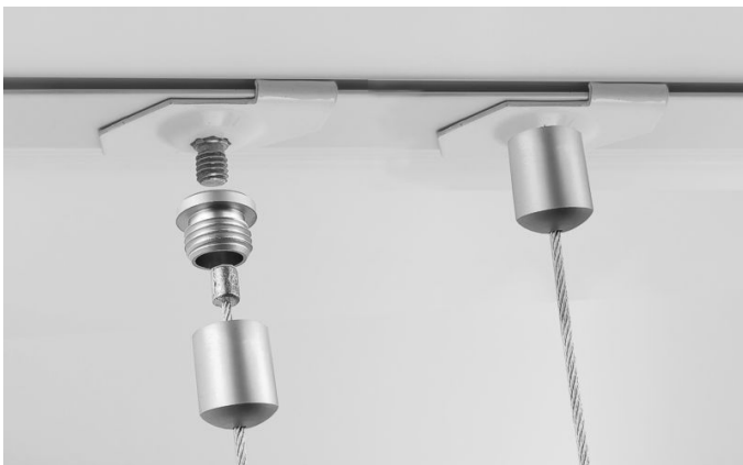
Twist Ceiling Anchor Locks onto standard ceiling grids