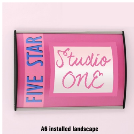
A6 installed landscape