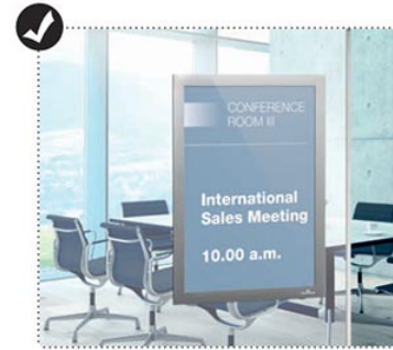
Simple! Frame can be fixed on solid and smooth surfaces. Can be removed from surfaces such as glass