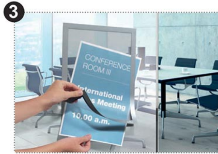
3 Lift the front frame and insert materials