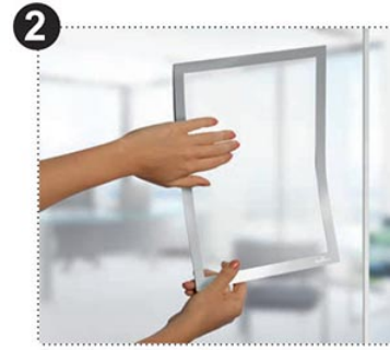
2 Attach in the desired position