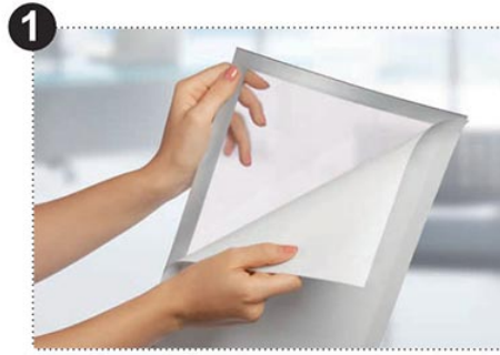
1 Remove the protective film