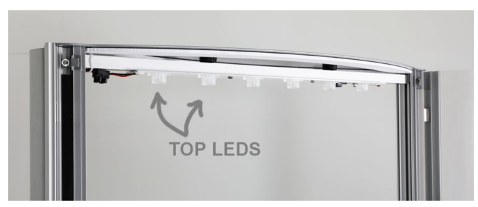
BRIGHT UNIFORM INTERNAL ILLUMINATION (Front and rear light diffuser sheets removed to reveal LEDs)