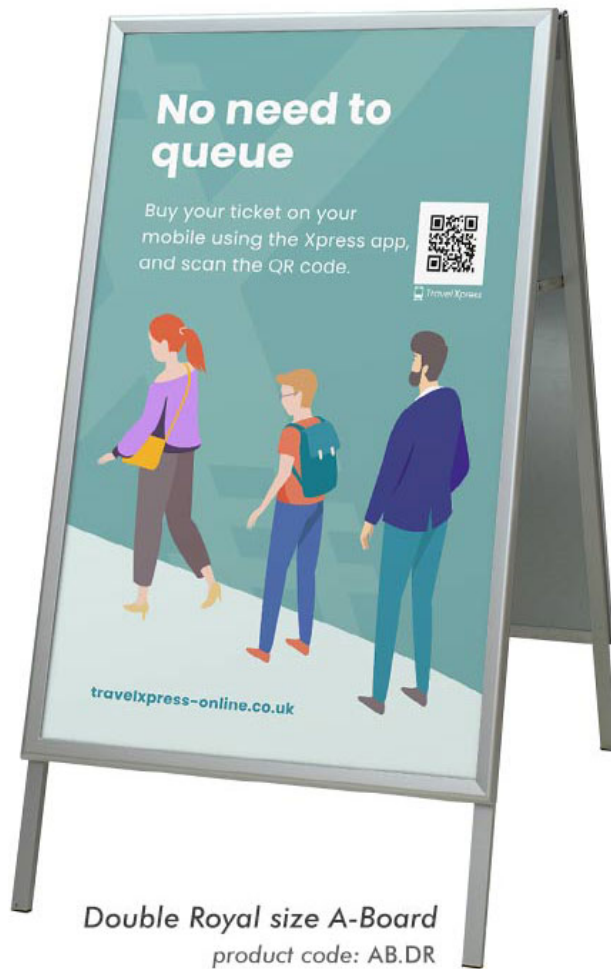
Double Royal size A-Board product code: AB.DR