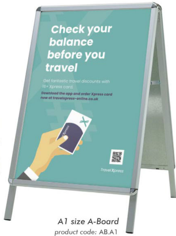
A1 size A-Board product code: AB.A1