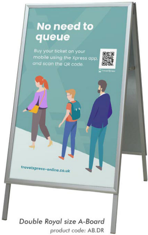
Double Royal size A-Board product code: AB.DR