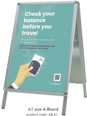
A1 size A-Board product code: AB.A1