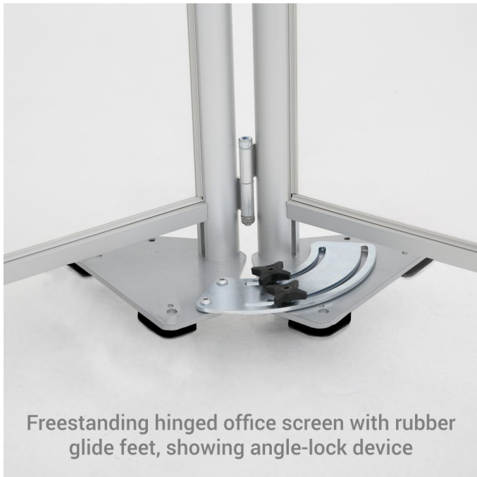
Freestanding hinged office screen with rubber glide feet, showing angle-lock device