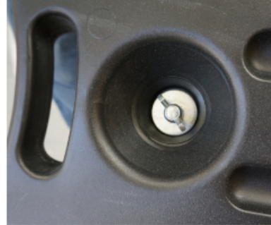
Insert bolt with washer into base undersi screw into springs and tighten.

You will find the box containes two spring assemblies together with the double-sided poster frame and the base. The base should be filled with water after assembly and before use outdoors.