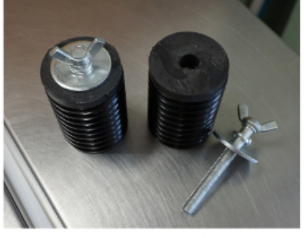
1. Remove Bolts from Springs.