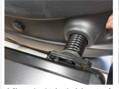
3. Place springs into locating holes on top of base.

Insert bolt with washer into base undersister screw into springs and tighten.