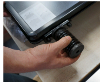
2. Screw springs onto base of frame.