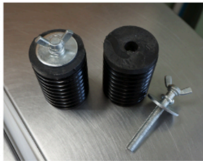
1. Remove Bolts from Springs.