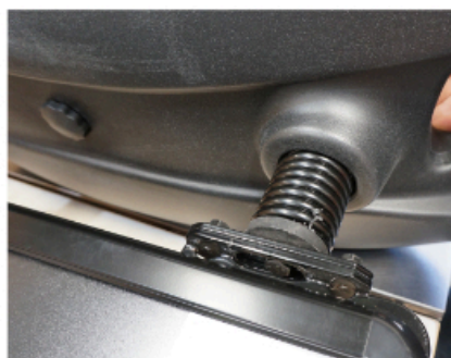
3. Place springs into locating holes on top of base.