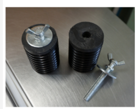
1. Remove Bolts from Springs.