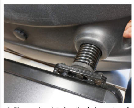
Place springs into locating holes on top of base.