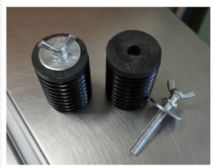
1. Remove Bolts from Springs.