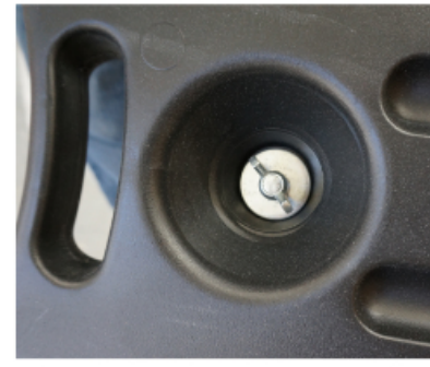
Insert bolt with washer into base undersi screw into springs and tighten.

You will find the box containes two spring assemblies together with the double-sided poster frame and the base. The base should be filled with water after assembly and before use outdoors.