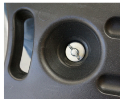
4. Insert bolt with washer into base under screw into springs and tighten.

You will find the box contains two spring assemblies together with the double-sided poster frame and the base. The base should be filled with water after assembly and before use outdoors. Unscrew the metal wing bolt with metal washer from the spring assemblies. Both black spring units, complete with their black plastic threaded fittings at each end of the spring, should be screwed into the bottom of the frame. The frame with springs attached should then be located into the grey plastic base. From beneath the base the wing bolts should be passed through the metal washers and inserted up through the base. Once engaged in the thread inside the springs the wing bolts should be fully tightened by hand.